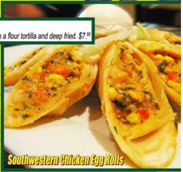
Southwestern Chicken Egg Rolls

Fresh fried tortilla chips served with mild salsa. $3. 95